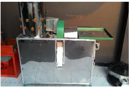
Figure 8. Product Work IbIKK Lecturer and Student: Parer and onion chopper Machine

Parer and onion chopper Machine designed for the needs of the restaurant that requires speed in peeling onions along with chopper.