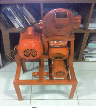
Figure 4. Product IbIKK Lecturer and Student Work: Machine of Maker Pellet Feed and Fish

Pellet Machine Manufacturers Fish Feed and designed by combining the two instruments, namely: rice husk crusher and pellet maker. The most interesting of these tools is the raw material pellets derived from rice husk, rice husk is very abundant because available around us and cheap so it is very interesting to improve its economic value. This machine is also very practical approach to mobilization portable very high.