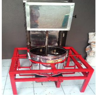
Figure 6. Product Work IbIKK Lecturer and Student: Dough Dodol Food Machine

Dough Dodol Food Machine is designed for speed and flexibility of dough dodol that will be created. It is in need for an efficient and high economic value.