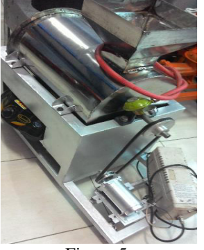
Figure 5. Product Work IbIKK Lecturer and Student: Oil Food Dryer Machine

Oil Food Dryer Machine designed to control the rotation of the cylinder where the food to be dried. It is intended to foods and soft textured hard putaranya speed can be set so as not to be damaged.