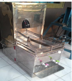
Figure 7. Product Work IbIKK Lecturer and Student: Purification and Water Dispenser Machine

Purification and Water Dispenser machine designed by combining two tools, namely: water purifying device and Dispenser. The point of the purifier water is water that has not been cooked from taps can purifier is put into place and then directly related to the functioning Dispenser as heating and cooling water. And can be directly in consumption, this device combines two functions.