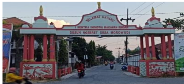
Figure 1. Ngebret Hamlet, Morowudi Gresik Village

Morowudi is located close to the district center of Cerme (±3 km to the south). This village is quite crowded because it is on the main road of Cerme. The village is bordered by Iker-Iker, Boboh, Putar Lor, Suikoanyar, and Guranganyar. The naming of this village is related to the era before Indonesia's independence.