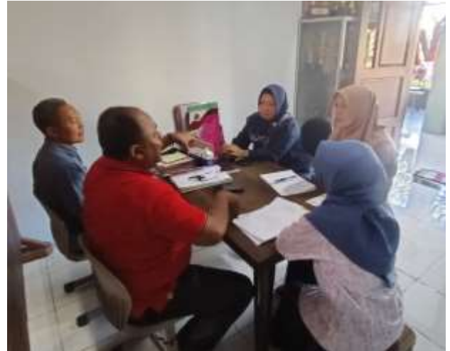
Figure 3 Focus Group Discussion