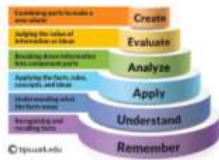
Figure 1: The Revised Bloom Taxonomy