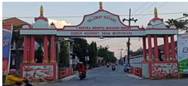
Figure 1. Ngebret Hamlet, Morowudi Gresik Village

Morowudi is located close to the district center of Cerme ( \pm 3 km to the south). This village is quite crowded because it is on the main road of Cerme. The village is bordered by Iker-Iker, Boboh, Putar Lor, Sukoanyar, and Guranganyar. The naming of this village is related to the era before Indonesia's independence.