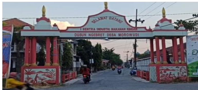
Figure 1. Ngebret Hamlet, Morowudi Gresik Village

Morowudi is located close to the district center of Cerme ( \pm 3 km to the south). This village is quite crowded because it is on the main road of Cerme. The village is bordered by Iker-Iker, Boboh, Putar Lor, Sukoanyar, and Guranganyar. The naming of this village is related to the era before Indonesia's independence.