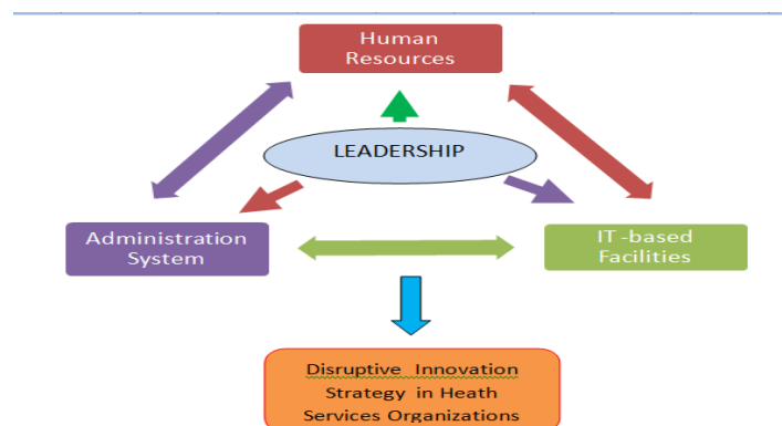
Figure 1: Model of innovation strategi in disruptive era

Based on the findings of this study we try to formulate a model to develop a health innovation strategy in the era of disruption as shown below: