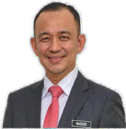
YBhg. Dr. Maszlee Malik Minister of Education Malaysia

I would like to first congratulate Universiti Teknologi MARA (UiTM) in particular the Faculty of Administrative Science and Policy Studies for organising this vital knowledge event and for the hospitality.