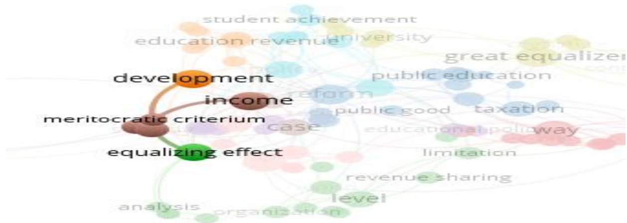
Figure 1. Vosviewer Result